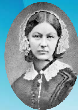
Florence Nightingale 2 May 1820 - 13 August 1910

AAKAR BAHUDESHIYA GRAMIN VIKAS SANSTHA, NAGPUR