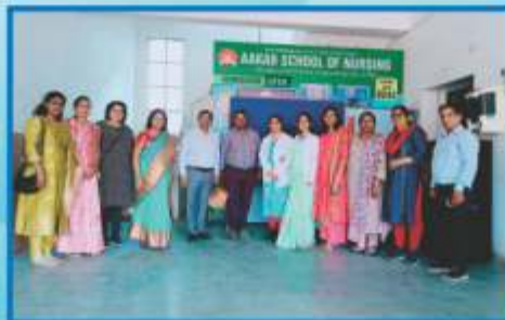
Visit of Interview Committee Members of MUHS