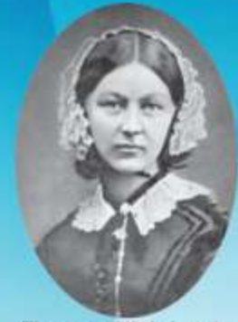
Florence Nightingale 2 May 1820 - 13 August 1910

AAKAR BAHUDESHEIYA GRAMIN VIKAS SANSTHA, NAGPUR