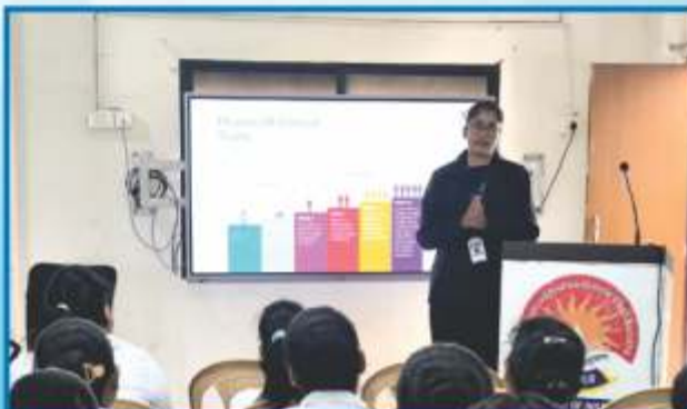
Seminar on Clinical Research Awareness & Personality Development