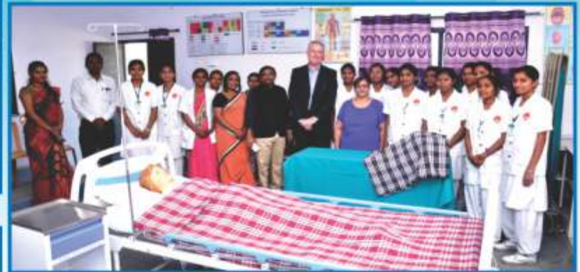
Visit of CEO Health Career International, Australia